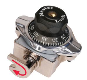
Latch Wraps Around The Latch Plate

The patented model 1690, 1695MKADA, and 1790 built-in locks use the same technology as an automotive door lock system, utilizing slam shut operation combined with a rotating latch that wraps around the latch plate. Designed for Single Point Latch Lockers, these locks provide the most robust design and requires the least adjustment for proper operation (U.S. Patent No. 7,984,630).